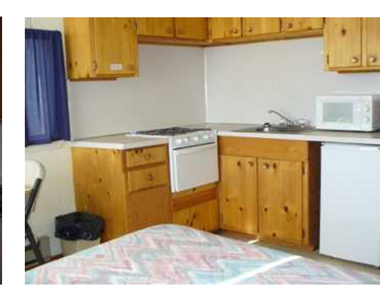
Each studio cabin has a queen bed, its own kitchen, & a bathroom with shower. The cabins are fully furnished, including bedding.