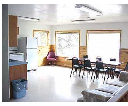
The deluxe, 3-bedroom, 2-story cabin has its own kitchen & bathroom with shower. The cabin includes 3 queen beds & a hide-a-bed, & is fully furnished, including bedding.