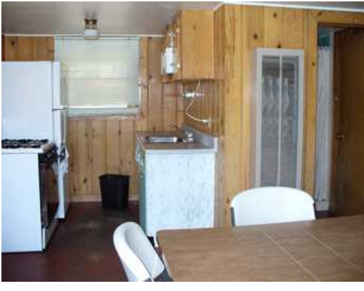
Each 2-bedroom cabin has 2 queen beds, its own fireplace, kitchen, & bathroom with shower. The cabins are fully furnished, including bedding.