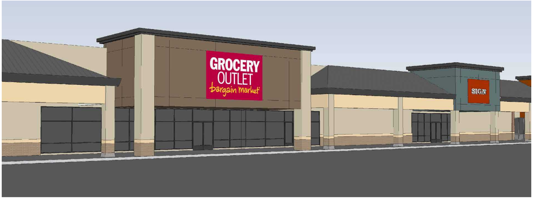
GROCERY OUTLET SOUTH PERSPECTIVE