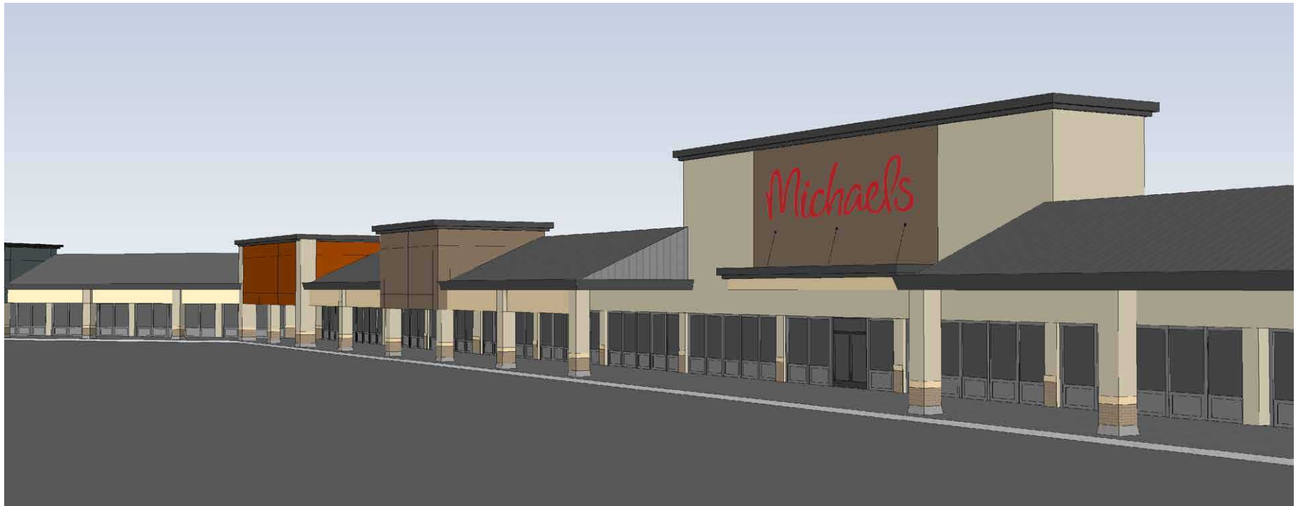
MICHAELS' NORTH PERSPECTIVE