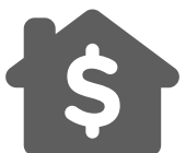
Average HH Income