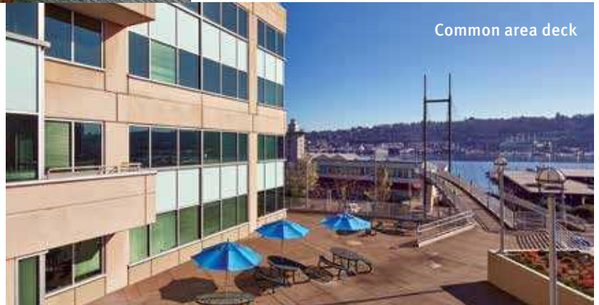
Common area deck

Let the scenery inspire you. Enjoy unfettered views of Lake Union and Downtown Seattle, and take in the fresh air from private and common-area decks. The city's natural beauty and Lake Union's active community is always on display.