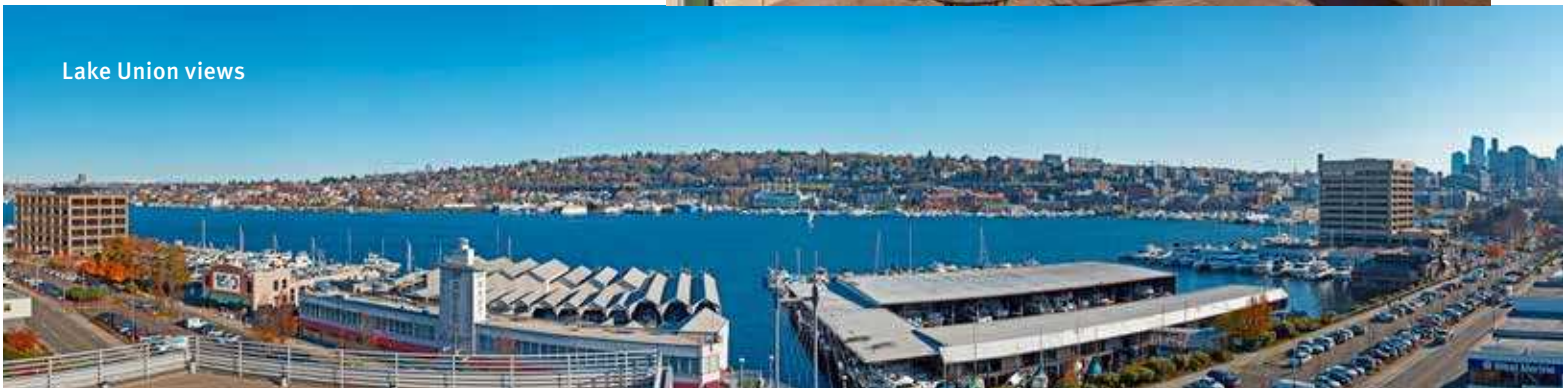
Lake Union views