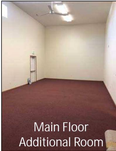
Main Floor Additional Room