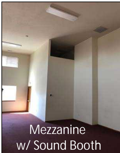
Mezzanine w/ Sound Booth